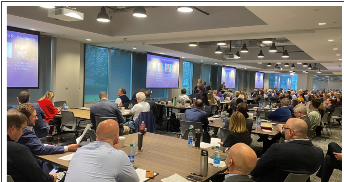
Hospital, Outpatient Facilities & Medical Office Buildings Summit – Charlotte, NC Dec 6, 2022