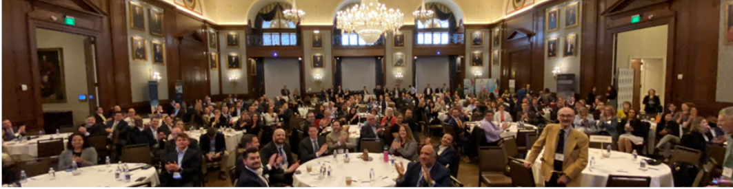
5th Philadelphia Hospital, Outpatient Facilities & Medical Office Buildings Summit March 1, 2023