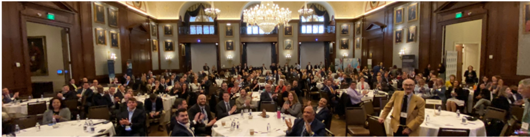
5th Philadelphia Hospital, Outpatient Facilities & Medical Office Buildings Summit March 1, 2023