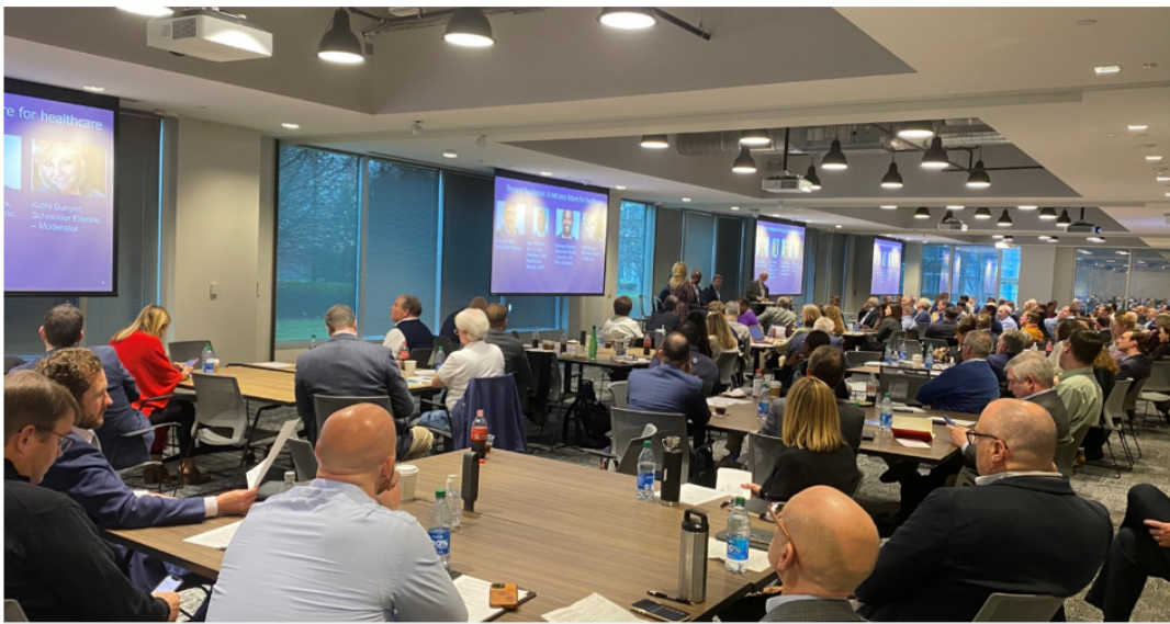
Hospital, Outpatient Facilities & Medical Office Buildings Summit – Charlotte, NC Dec 6, 2022